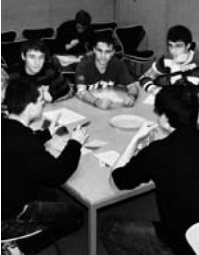
Regional Negotiations of the Southeast African group